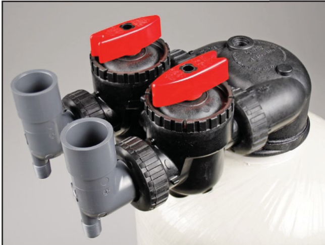
1191 In-Out Head shown with optional V3006 Bypass Assembly and V3007-01 3/4" x 1" PVC Solvent Elbow Assembly