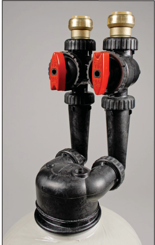
1191 In-Out Head shown with optional V3191-01 Vertical 90° Adapter Kit, V3006 Bypass Assembly and V3007-13 1" SharkBite® Fittings